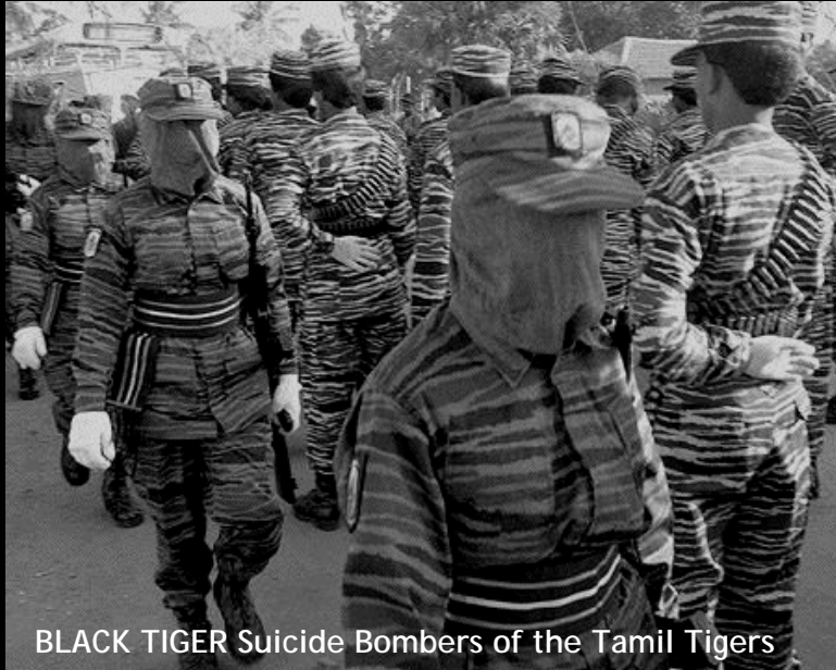
BLACK TIGER Suicide Bombers of the Tamil Tigers

"..The Tamil Tigers are among the most dangerous and deadly extremists in the world.." [1]